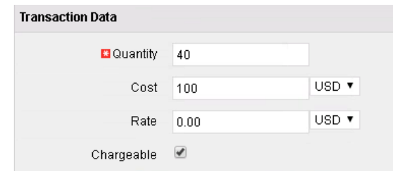
Transaction Entry Screen - Quantity, Cost and Rate