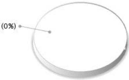
Top Targets Attacked by Group